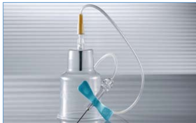
Suitable for BacT / Alert and BacTec blood culture bottles.

In order to provide a complete product line for all requirements, a standard Blood Collection Set (without safety mechanism) is also available with pre-assembled Blood Culture Holder.