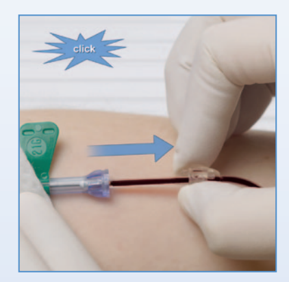
6 Audible click indicates activation

5 Activate the safety mechanism (by pressing down and pulling back the lighter coloured area)