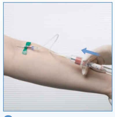
3 Insert the tube

* For the complete handling recommendation please refer to the Instructions for Use for each product.