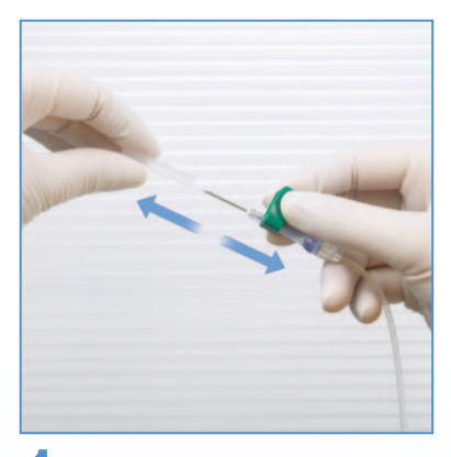
Remove protective cap