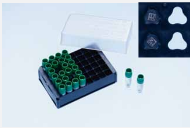
Figure 1: Datamatrix Cryo Rack with 48 positions for tube storage and bottom openings for scanning and tube identification.

Cryo.s™ with Datamatrix may be stored in larger units – the Datamatrix Cryo Racks – each providing space for 48 samples and carrying its own ID. Windows in the bottom portion of these racks allow for the scanning and identification of an entire array of tubes (Fig.1). Thus, every rack scan can identify not only the contained samples, but also their position within the rack as well as empty positions available for future samples. When it comes to sample retrieval all required information may be extracted from the database including sample ID, rack ID and position of the sample in the rack. On this basis a specific sample of interest may be selected and recovered from the storage. A final single tube scan may be carried out to cross-check the identity of the recovered sample and to delete it from the database.