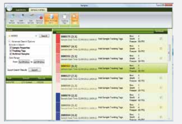
Figure 4: Screenshot of Ziath's software 'Samples'<sup>3</sup>. The web-based software Samples is fully integratable with Ziath DataPaq 2D barcode scanners and Greiner Bio-One's Datamatrix Rack. It assists scientists with the management and tracking of their samples as well as the planning, sharing and execution of lab protocols.