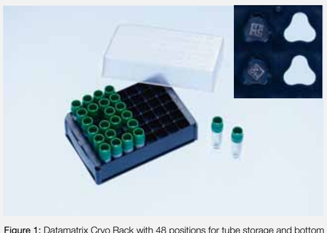
Figure 1: Datamatrix Cryo Rack with 48 positions for tube storage and bottom openings for scanning and tube identification.

Cryo.s<sup>™</sup> with Datamatrix may be stored in larger units – the Datamatrix Cryo Racks – each providing space for 48 samples and carrying its own ID. Windows in the bottom portion of these racks allow for the scanning and identification of an entire array of tubes (Fig.1). Thus, every rack scan can identify not only the contained samples, but also their position within the rack as well as empty positions available for future samples. When it comes to sample retrieval all required information may be extracted from the database including sample ID, rack ID and position of the sample in the rack. On this basis a specific sample of interest may be selected and recovered from the storage. A final single tube scan may be carried out to cross-check the identity of the recovered sample and to delete it from the database.