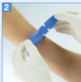
2 Pull opposite end through the slit.