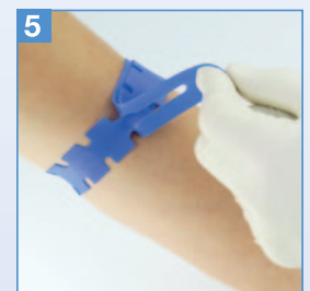
5 Release Tourniquet by pulling end with slit.