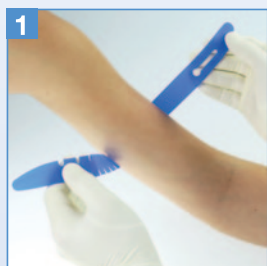
1 Place Tourniquet in position.

For the complete handling recommendations please refer to the Instructions for Use at www.gbo.com .