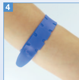
4 The Tourniquet will then lock in position.