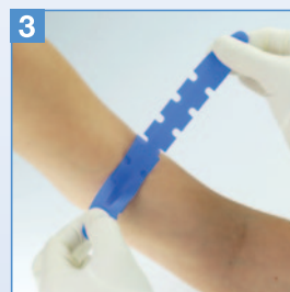
3 Continue pulling until desired tension is reached.