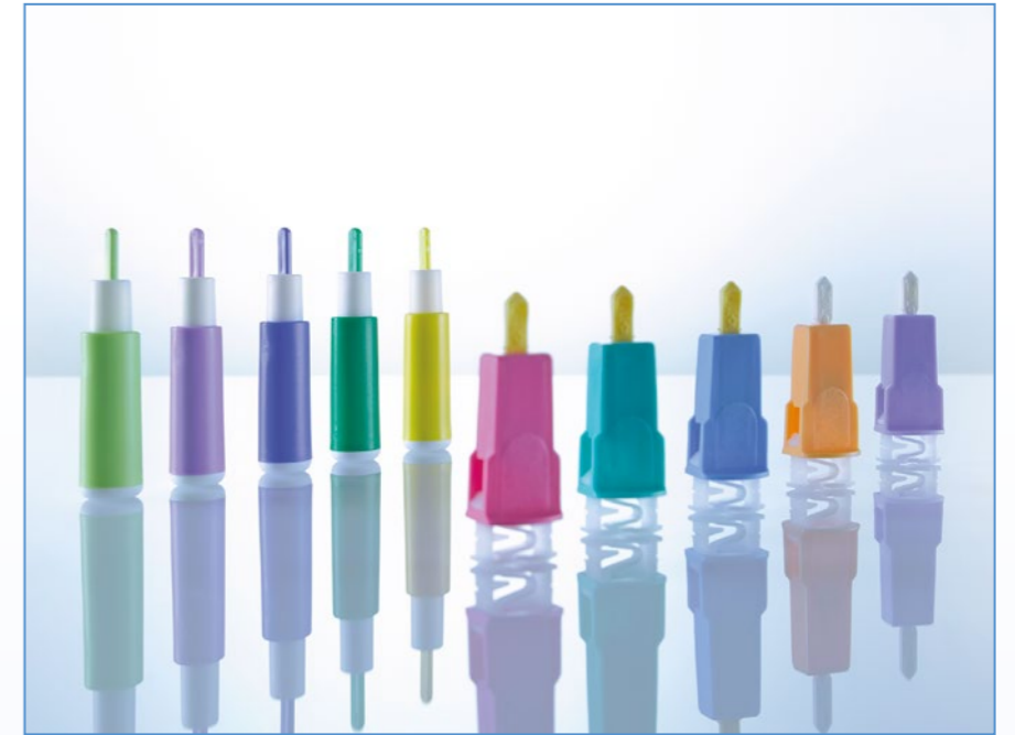
Lancets are colour-coded for easy identification of puncture depth and application.

The safety mechanism ensures that the blade/needle is automatically retracted after the puncture and is safely enclosed within the plastic housing. In particular when dealing with our youngest patients it is imperative that the procedure be as gentle as possible to avoid causing unnecessary anxiety. The safety mechanism means that the blade/needle is hidden from view, allowing the blood collection to take place in a more relaxed atmosphere for all concerned.